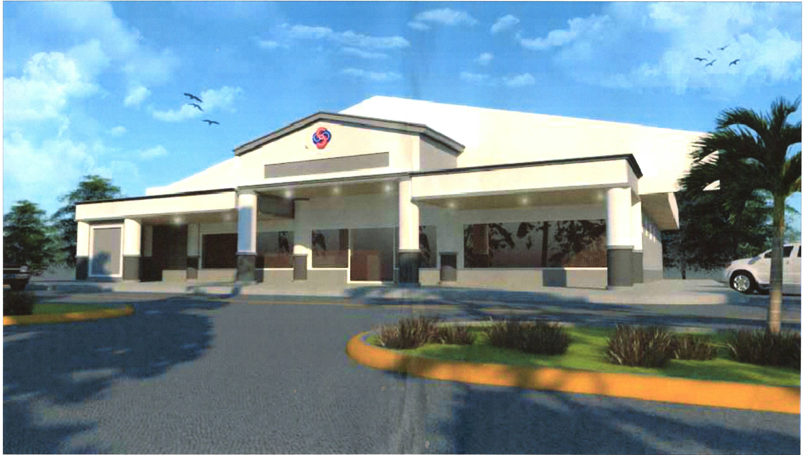
1 PERSPECTIVE VIEW AO AO NOT TO SCALE

SATISFACTORY TO: KENNETH LEMUEL G. REMENTILLA DA FOR BUSINESS GROUP